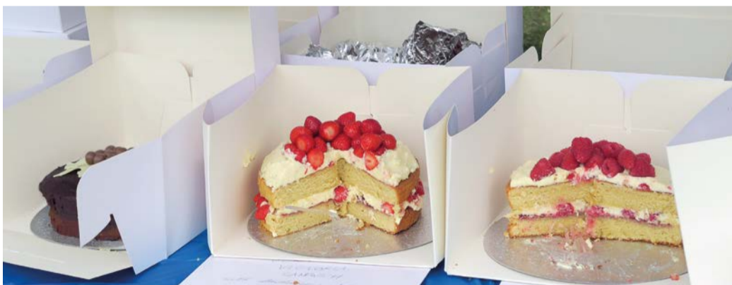
At the Summer Fair many will remember the delicious cakes made and donated by many local residents. These raised the large sum of £176.50 on the day, which it was decided would be presented to St Jude's church for their restoration fund. Additional expenses arose over the work on the steeple, when it was found repointing the brickwork was urgently needed before the next stage could be done and hopefully this will help to preserve our famous landmark.

There was a general feeling that in many areas enforcement (continued on page 3)