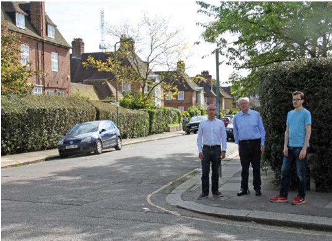
Suburb Ward councillors meet to assess impact of proposed tall building