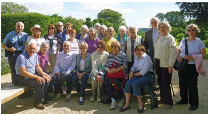
Members on July trip at Hanham Court