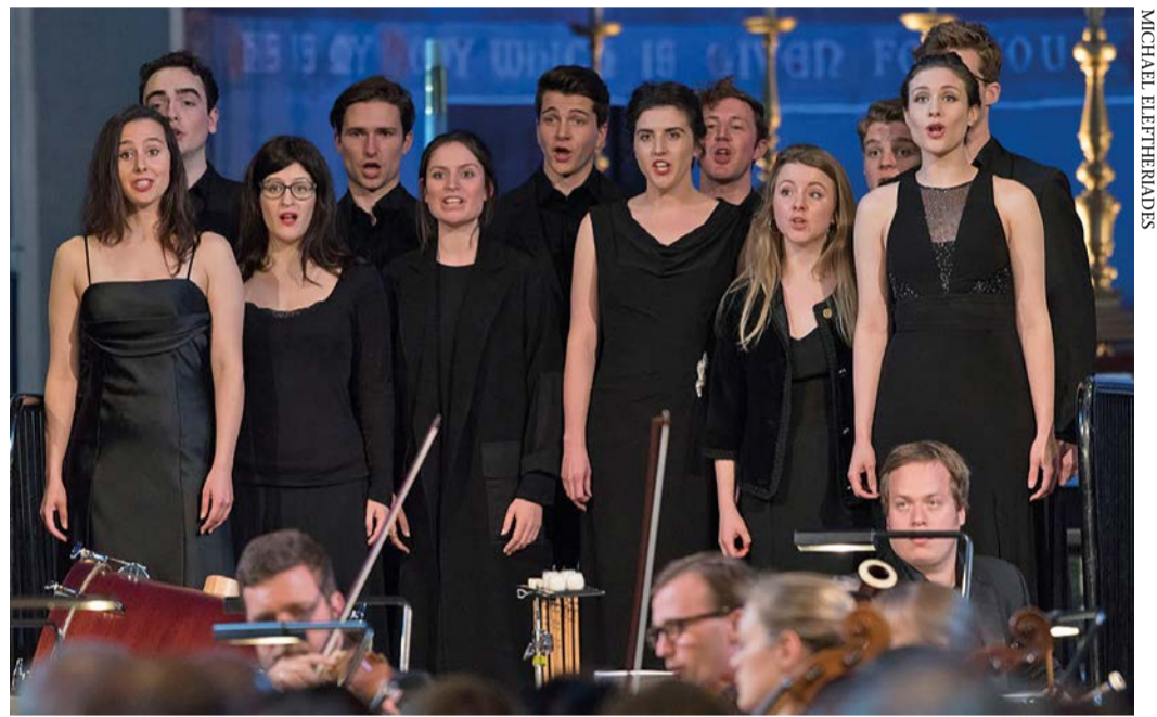
Choir of the 21st century