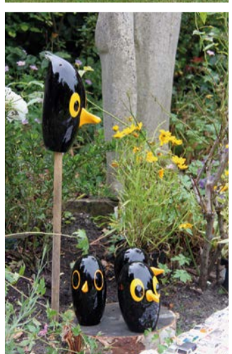
(Top, left & right) 32 Brooklands Rise (Bottom, left & right) 14 Edmunds Walk