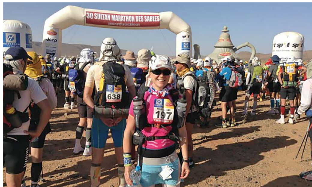
A dynamic Style Dynamo at the 2015 Marathon des Sables