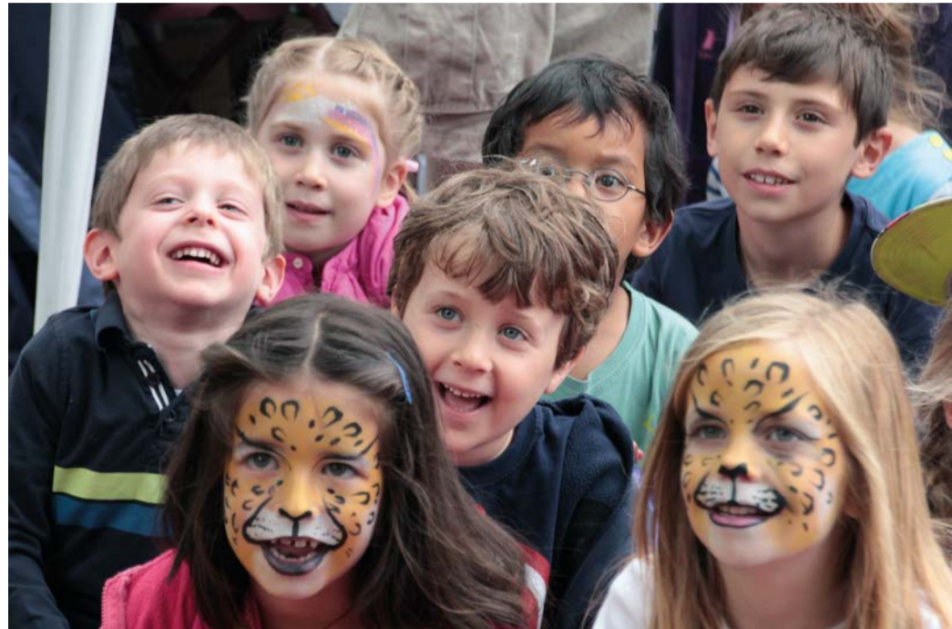
Only one duo can keep a whole bunch of kids and a pair of tigers amused for so long - it's Punch and Judy of course, performing again at this year's RA Summer Party on Sunday 12 June. Full details, back page