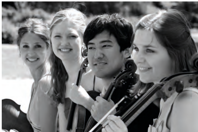
(Above) Benyounes Quartet; (Below) Florin Ensemble; (Bottom) Counterpoise