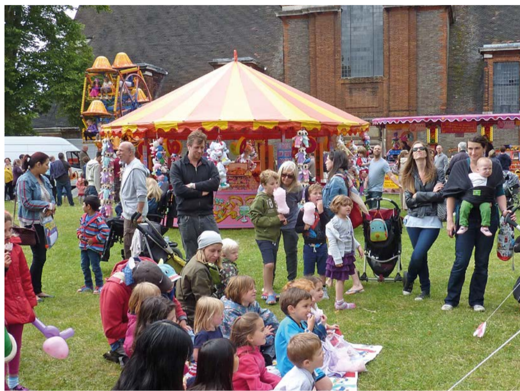
Last year's dazzling Fun Day is to be repeated again this year on June 28. See article on page 3.