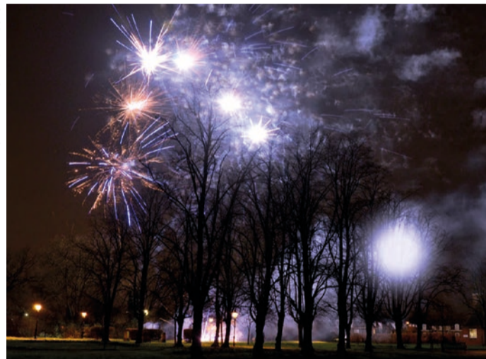
A spectacular display on Central Square starts the new year off on the Suburb