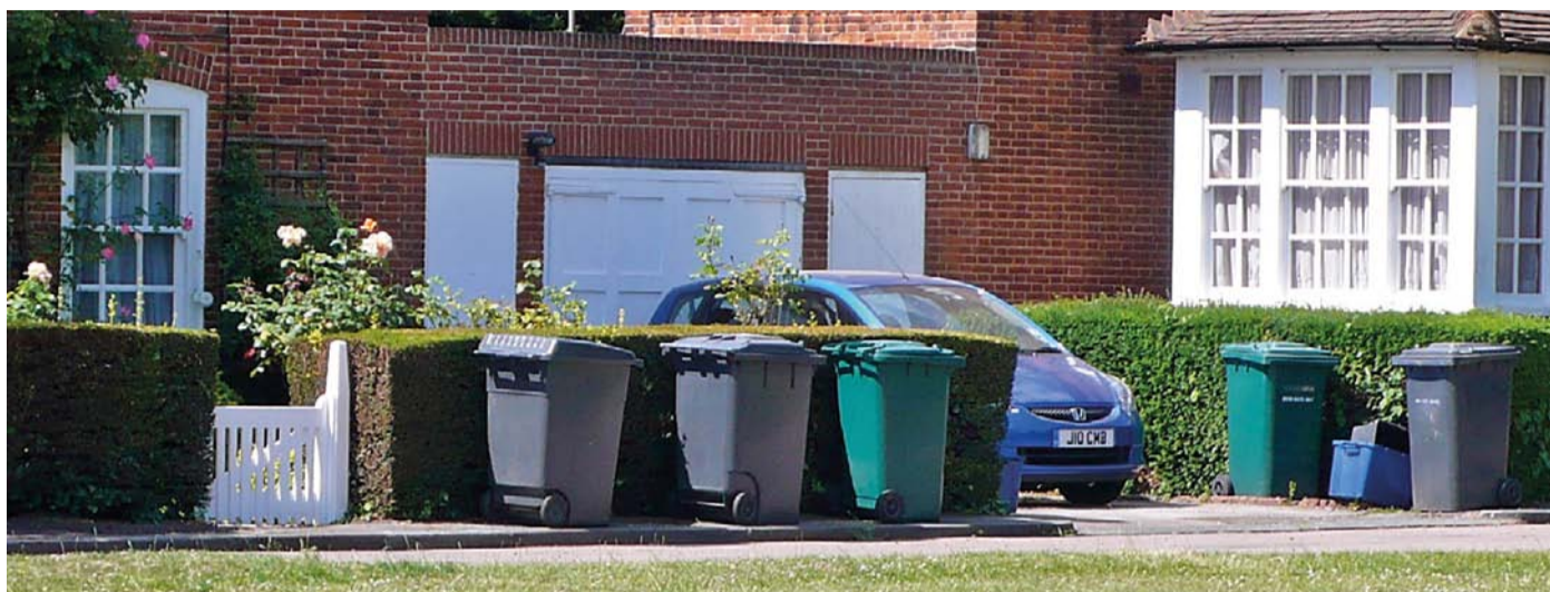
When wheeled bin rubbish collection started there was an understanding that these, as we then thought, ugly objects would be kept out of sight. What's happening now? See p 7.