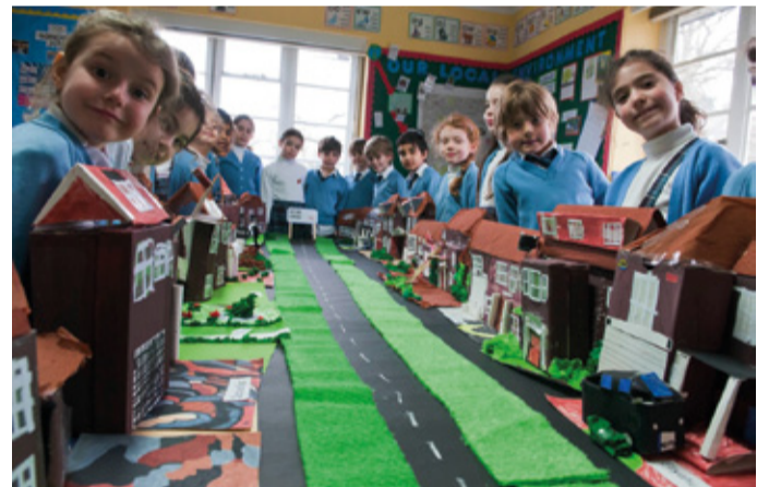
Annemount School pupils, who keep their eyes open during regular walks round the Suburb produced this model of houses in Holne Chase.