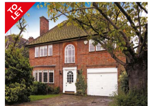
MEADWAY HAMPSTEAD GARDEN SUBURB NW11 Asking Price £1,250 per week