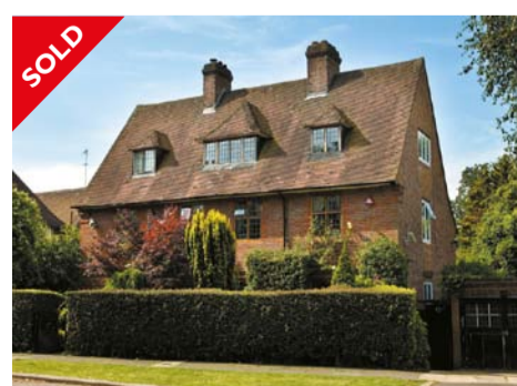
HAMPSTEAD WAY HAMPSTEAD GARDEN SUBURB NW11 Asking Price £4M