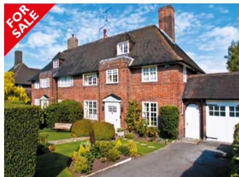
COTMAN CLOSE HAMPSTEAD GARDEN SUBURB NW11 Asking Price £1.6M