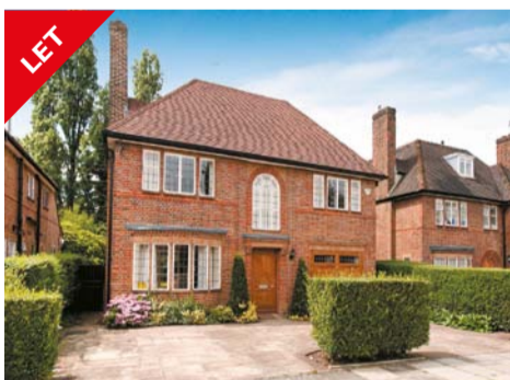
KINGSLEY WAY HAMPSTEAD GARDEN SUBURB N2 Asking Price £2,200 per week