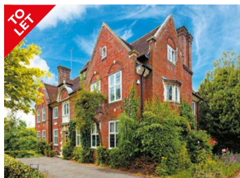
LINNEL DRIVE HAMPSTEAD GARDEN SUBURB NW11 Asking Price £2,250 per week