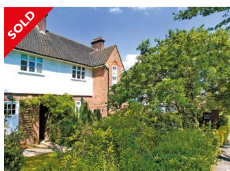
ERSKINE HILL HAMPSTEAD GARDEN SUBURB NW11 Asking Price £799,950