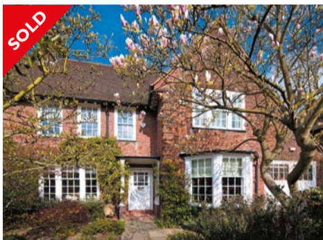
MEADWAY CLOSE HAMPSTEAD GARDEN SUBURB NW11 Asking Price £2.65M

This role involved visiting, talking, helping and supporting workers across a broad spectrum of businesses in the area – from the steelworks at Port Talbot to the Hoover plant in Merthyr to the staff of