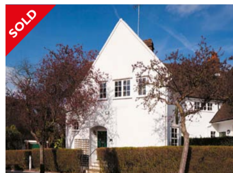
WILLIFIELD WAY HAMPSTEAD GARDEN SUBURB NW11 Asking Price £750,000