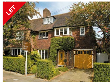
GURNEY DRIVE HAMPSTEAD GARDEN SUBURB N2 Asking Price £925 per week