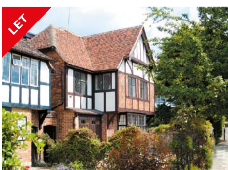
VIVIAN WAY HAMPSTEAD GARDEN SUBURB N2 Asking Price £1,750 per week