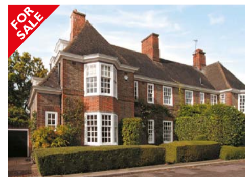
SOUTH SQUARE HAMPSTEAD GARDEN SUBURB NW11 Guide Price £4M