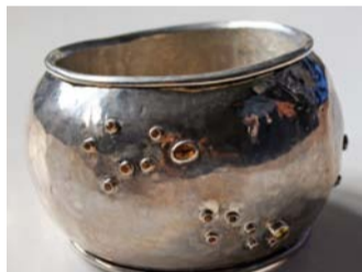
Silver bangle from Kochi Okada