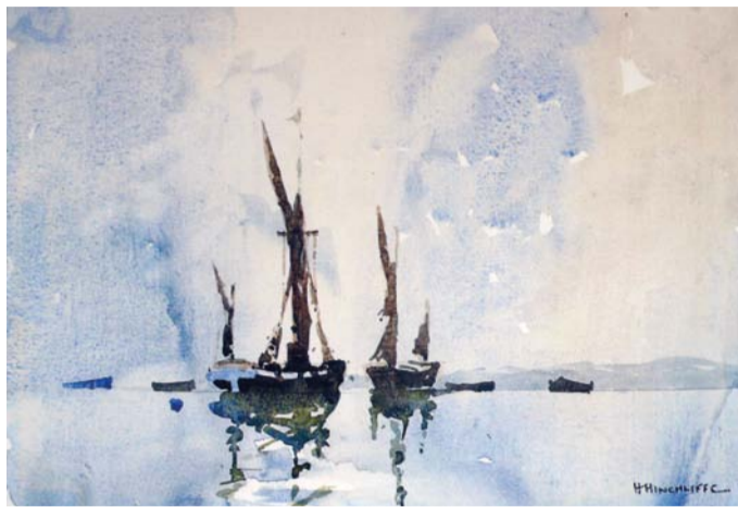
Harland Hinchliffe watercolours