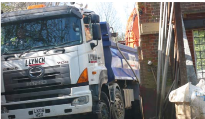
There was much consternation on the HGS list when 13 Hampstead Way almost disappeared overnight. The owner of the house, which overlooks the Heath, had been given permission for a certain amount of demolition preparatory to installing a basement which would have resulted in there being very little evident change to a rather handsome house. The Trust, on the case the next day, found that contractors had been overenthusiastic in demolishing all but the front and side walls and a chimney stack. Barnet and the Trust have taken action to ensure that the owners, at considerable cost, restore the house to exactly the same specifications as before. Meanwhile the pictures here show the effect a basement excavation has on the street and surrounding neighbours.