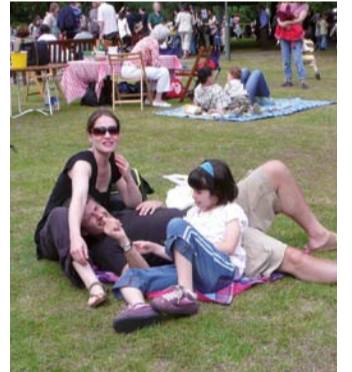
Previous picnics proved very popular.

For information please email raevents@hgs.org.uk .