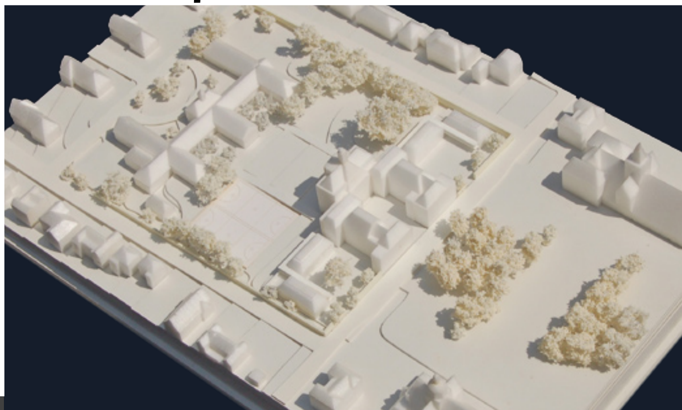
New build on Central Square – but to go at last (main story, front cover)