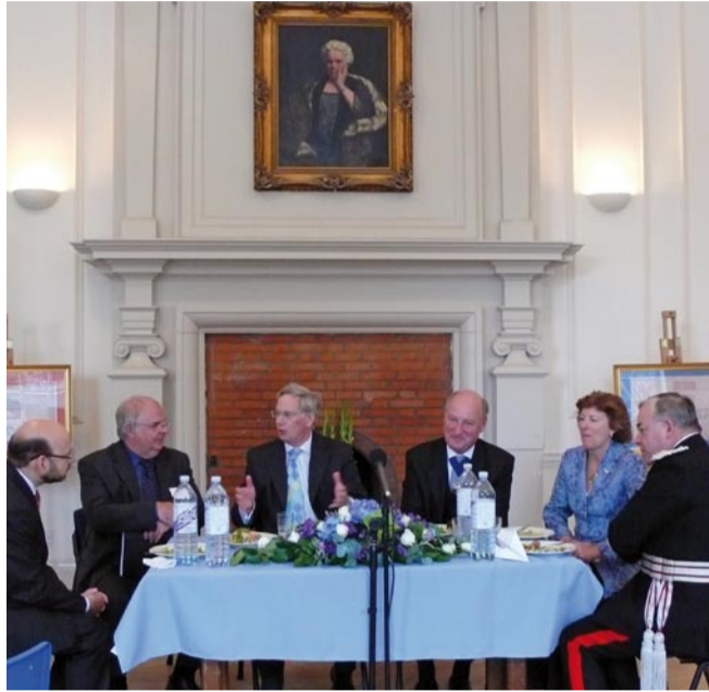
Lunch for HRH under the gaze of the Dame