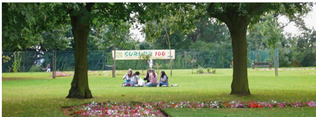
With the Square back to normal sixth formers, tennis players and the RA centenary banner remain