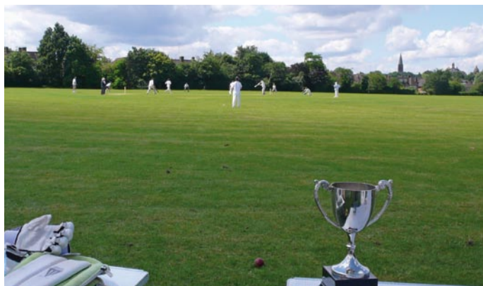
Centenary Sports Day