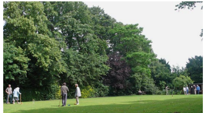
On the surface all was calm on the croquet lawn during the Fellowship Centenary Fair