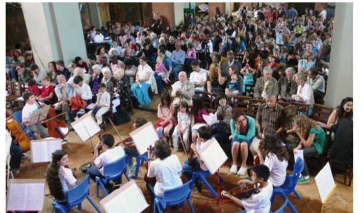
The Youth Music Centre Centenary concert packed St Judes