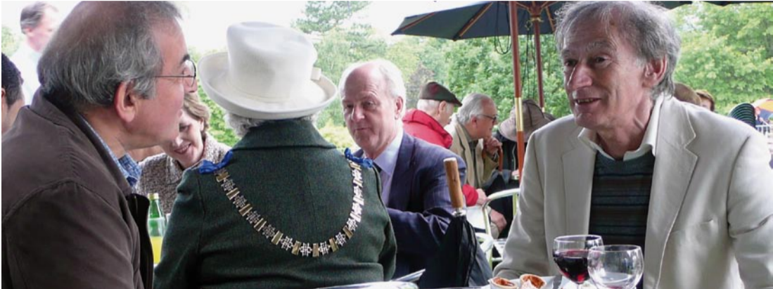
Lunch with the Lord Mayor and Mayor of Barnet in Golders Hill Park where the City of London laid on a lavish Celebration in the Park in honour of our centenary