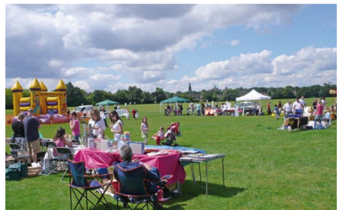
There were cricket, bowls, tennis as well as a bouncy castle on Lyttelton Playing Fields as the synagogue staged its Centenary Sports Day