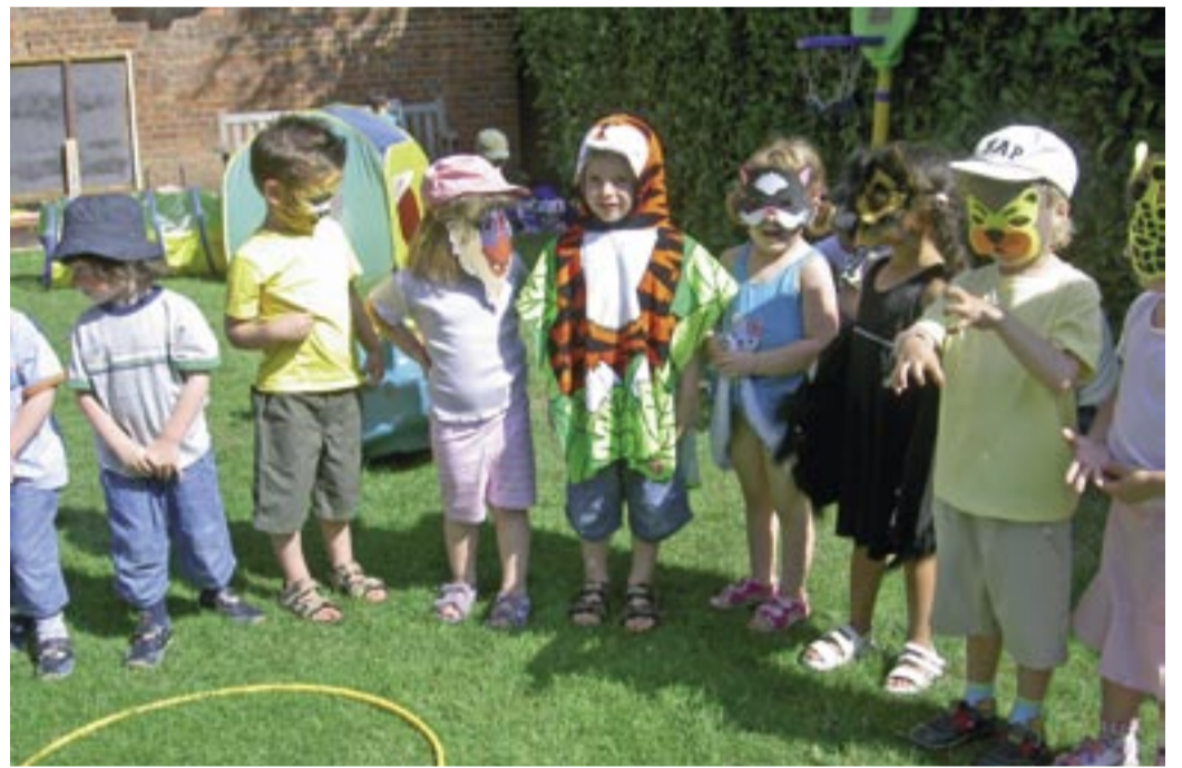
The Garden Suburb Preschool based in the Free Church Hall in Northway is one of the oldest Suburb institutions. Children between two and a half and five, from all sections of the community enjoy such activities as the animal day shown here.