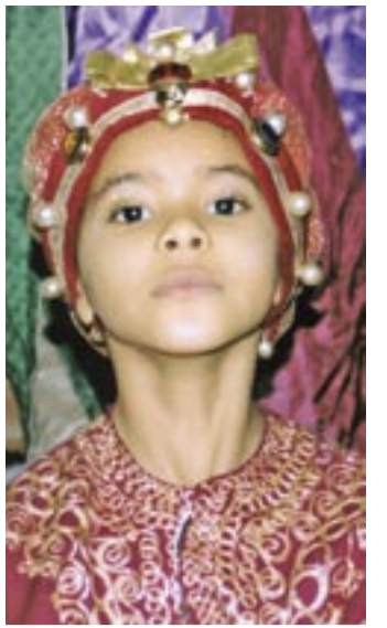
A large congregation of young families enjoyed the traditional nativity play at St Jude's enacted by members of the Sunday school.