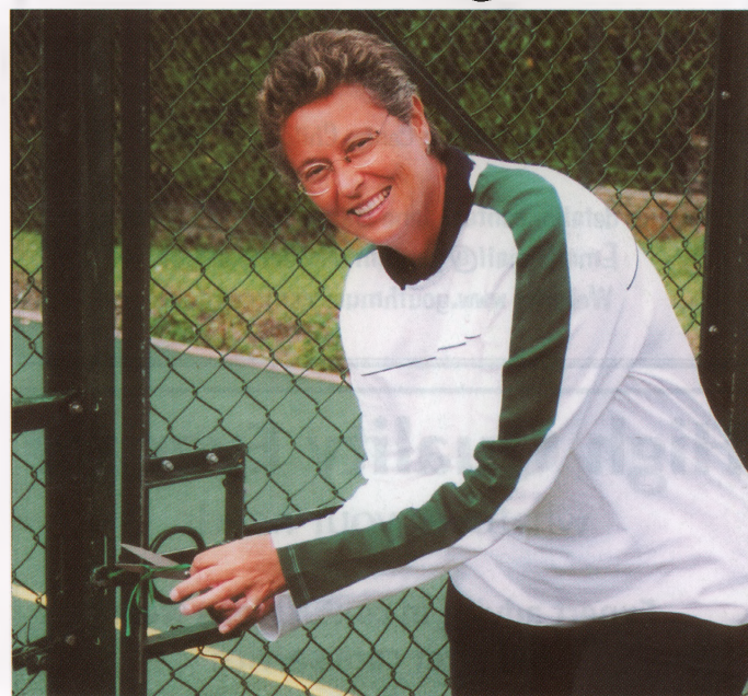
Wimbledon champion Jo Durie open the new courts