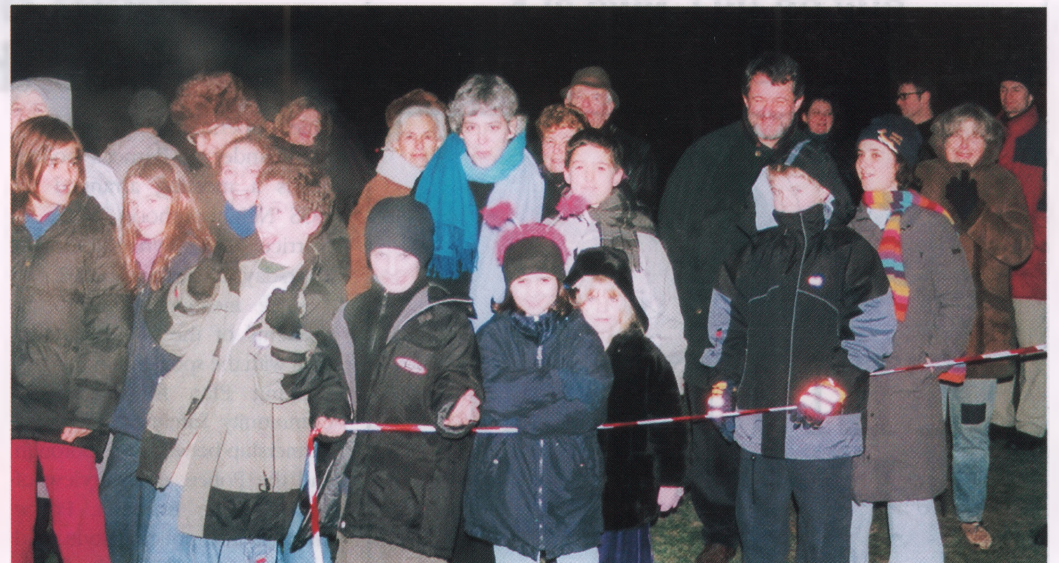
(Below) Even more residents enjoyed the RA fireworks party on New Year's Eve, see p 12