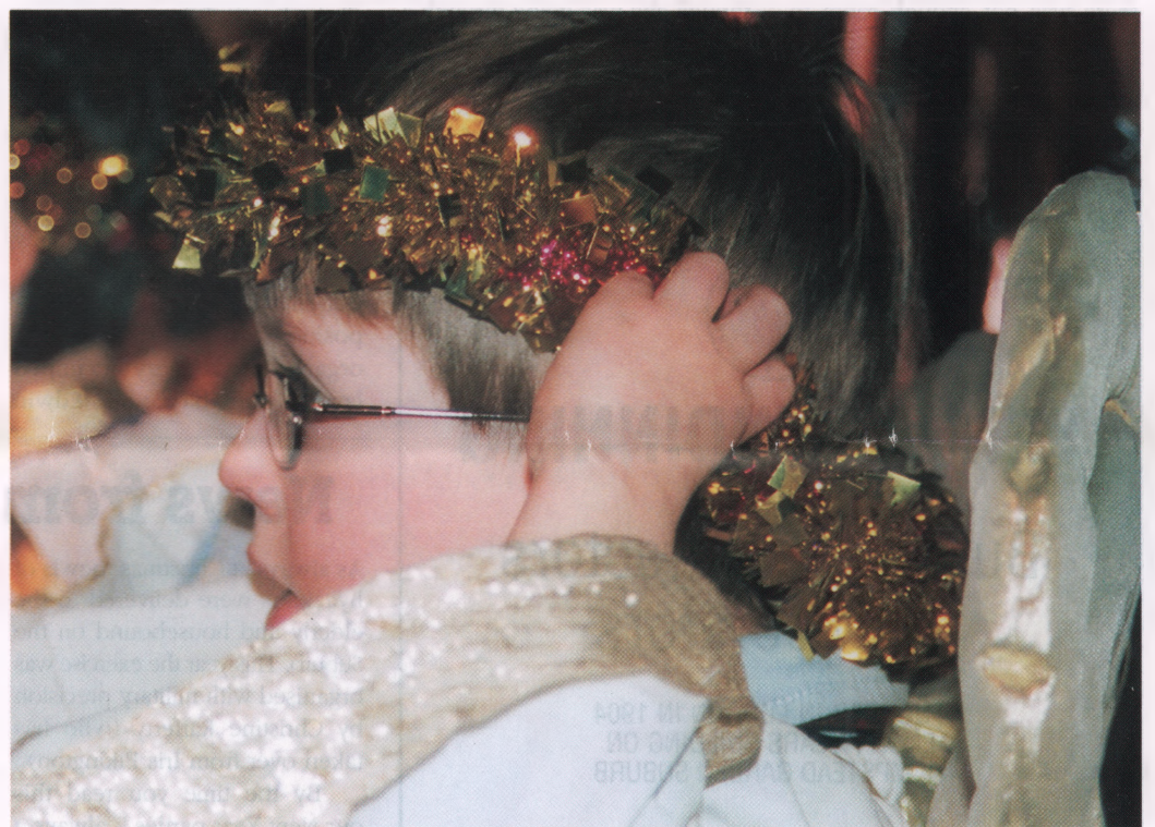
(Above) An angel at St Jude's at Christmas finds this acting business a bit nerve racking, see p 5