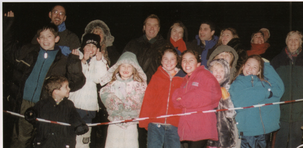
(Below) It was generally agreed the show was even better than last year's.