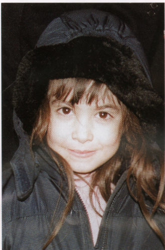
(Above) Lots of young residents joined the RA fireworks party