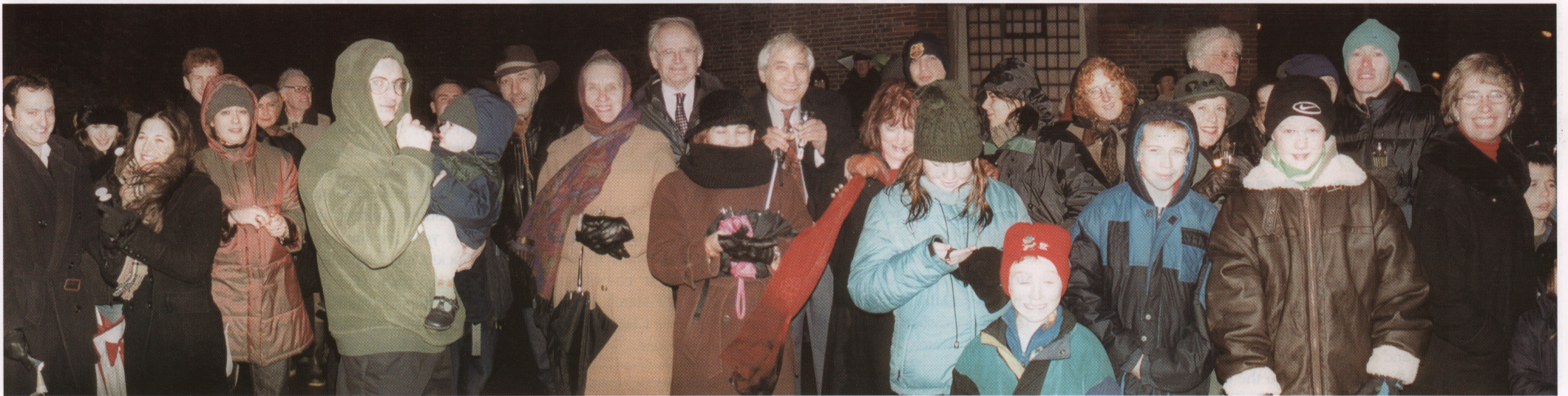
It was touch and go, on a cold and wet New Year's Eve, whether the Residents Association fireworks for the real millennium would happen. They did, and were much enjoyed by the several hundred who came to watch. See p3

THE HAMPSTEAD GARDEN SUBURB RESIDENTS ASSOCIATION NEWSPAPER ■ WINTER 00/01 ISSUE 70