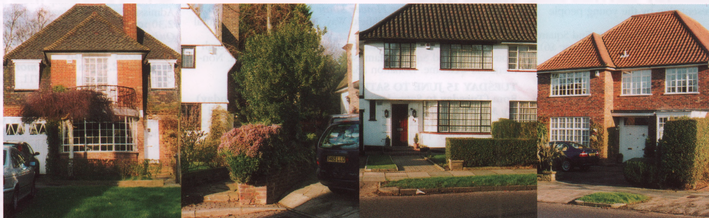
Ugly UPVC windows were replaced in Brim Hill

Householders who carry out unauthorised alterations can be, and are, legally obliged to undo the work, to rectify the 'infringement'.