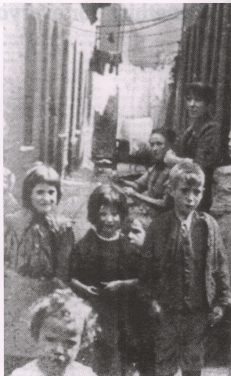
East End slum conditions