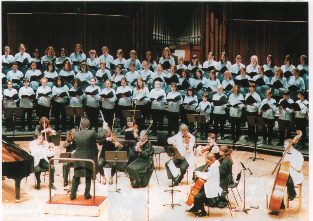
Finchley Children's Music Group appear in Bernstein's Chichester Psalms at St Jude's on May 24.