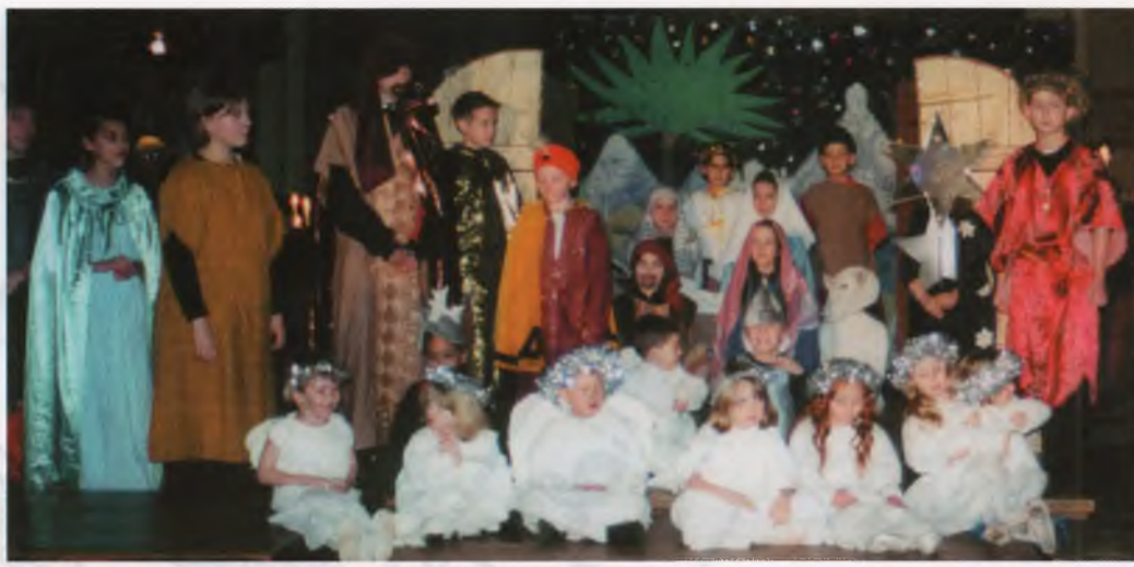
St Jude's nativity play on Christmas Eve, a magical production by young church members