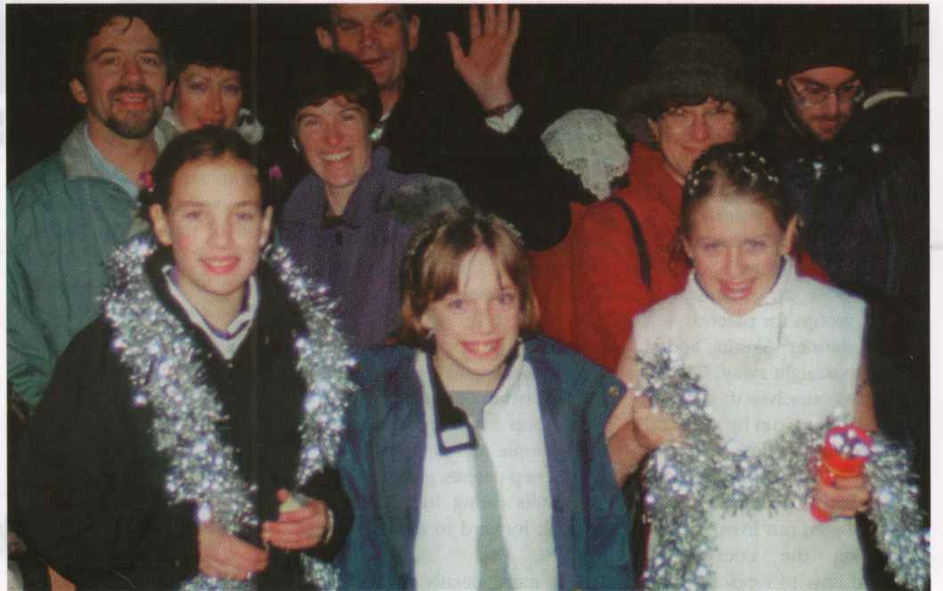
Waiting for the fireworks on Millennium Eve