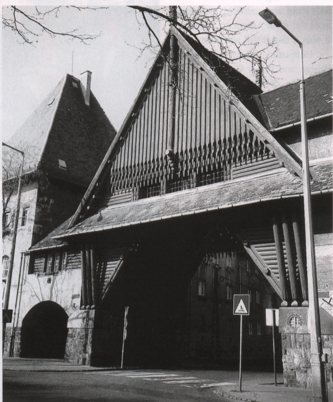
Bridge link, Kos Karoly Ter

Four diagonal and four lateral boulevards lead into the central square. Between these are subsidiary lanes giving an overall web pattern, with none of the subtlety of the layout at Hampstead Garden Suburb. The main boulevards are tree-lined, in the continental manner, but the gabled housing groups have some affinity with the familiar types in the Artisans' Quarter of NW11. The smallest houses are linked bungalows, with generous gardens and space for individual cultivation of fruit and vegetables. As at HGS, there appear to be few shops, although there are bars. Schools and churches were built contemporary with the housing, and the Gothic-style Catholic church with its tall campanile dominates the central square. Much of the housing is still rented, and occupied by working-class residents, but here is also evidence of free-market gentrification.