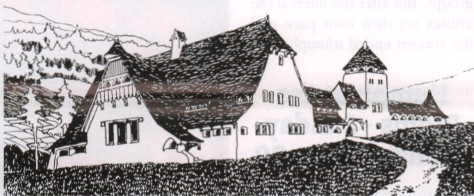
Design for manor house

Architecturally, the central square forms an appropriate climax. The east and west sides are occupied by linked four and five storey apartment blocks, bridging over the intermediate Hungaria Ut to form a continuous frontage. It is almost as if the Temple Fortune blocks of shops and flats were to be linked across Hampstead Way. Stylistically, there is some affinity between Temple Fortune and the apartments at Kos Karoly Ter.