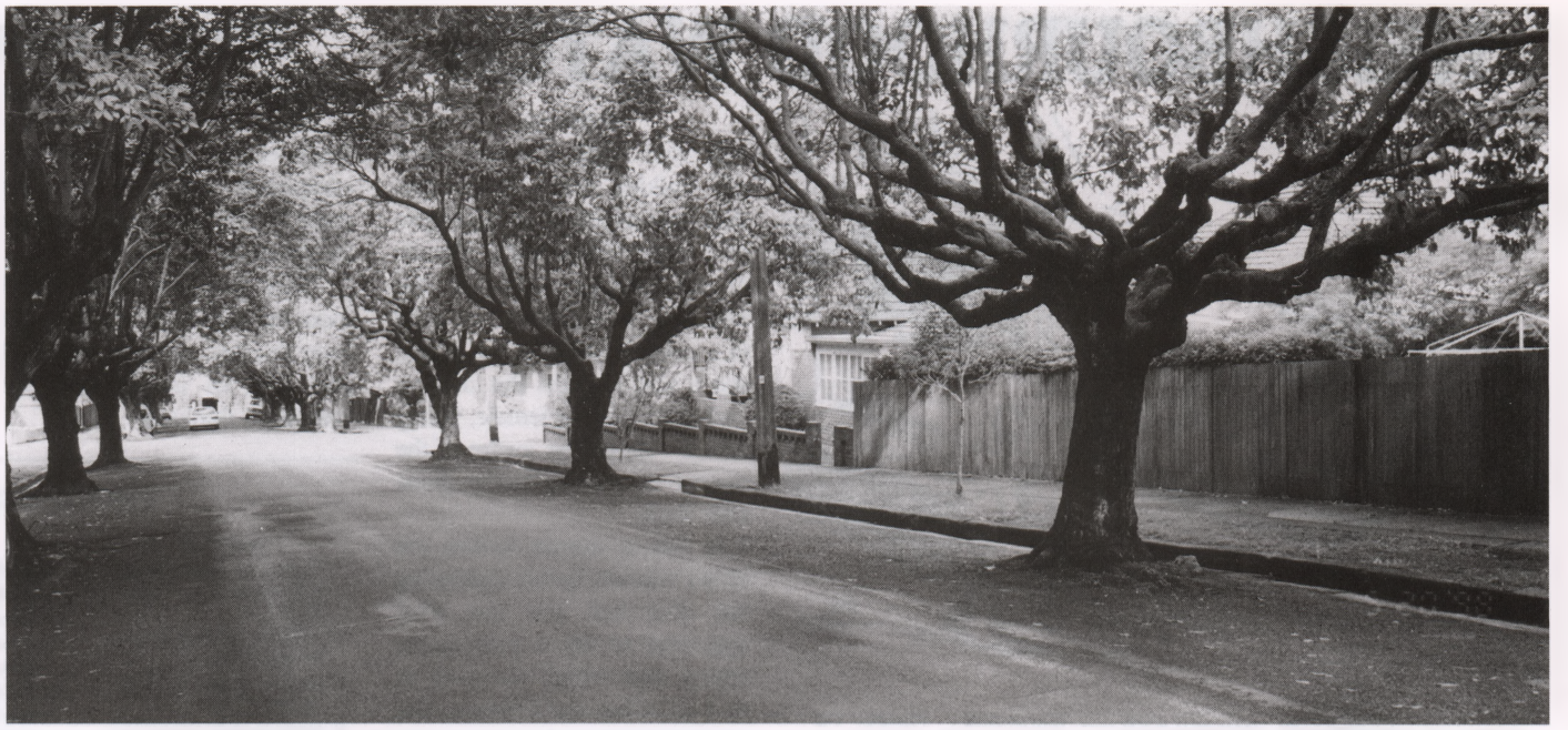
Street trees planted in the road rather than on pavements provide much needed shade in the summer.