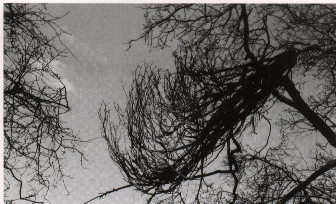
Rare Witches' Broom.