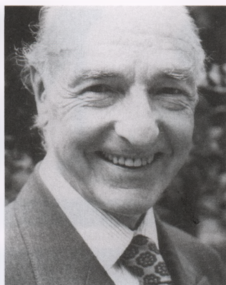
John Profumo, Toynbee Hall President