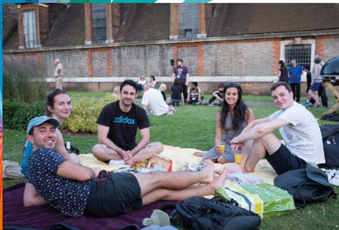
Picnic on the lawn