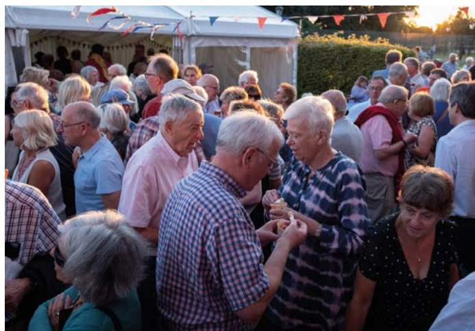
Ice cream in the interval