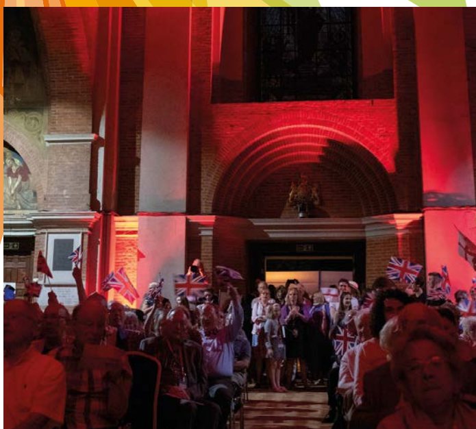
St Jude's on the Last Night