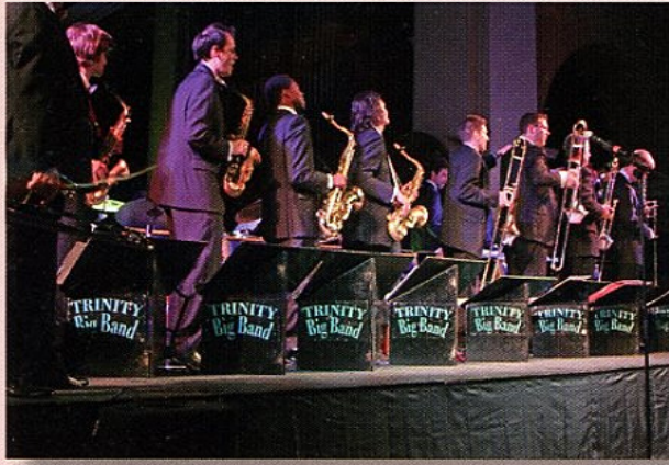
Trinity Big Band