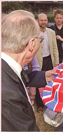
The mayor joins in the fun