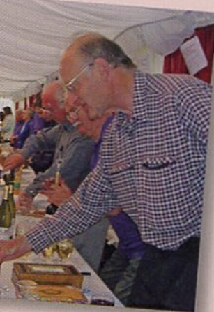
bar at interval time