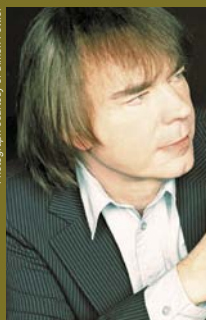
Julian Lloyd Webber