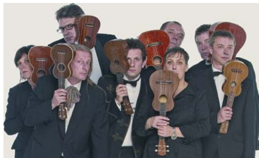
The Ukulele Orchestra of Great Britain

A group of all-singing, all-strumming ukulele players, who use instruments bought with loose change, and who believe that all genres of music are available for reinterpretation, as long as they are played on the ukulele. A concert by the Ukulele Orchestra is a funny, virtuosic, twanging, singing, awesome, foot-stomping cornucopia of rock-n-roll and melodious light entertainment featuring only the 'bonsai guitar' and a menagerie of voices; no drums, no pianos, no backing