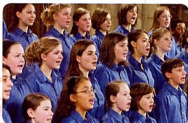
Finchley Children's Music Group – Senior Choir