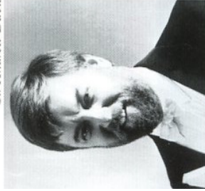
Sir Andrew Davis

Mon 21st June (No reserved seating) £10.00 Concessions £8.00