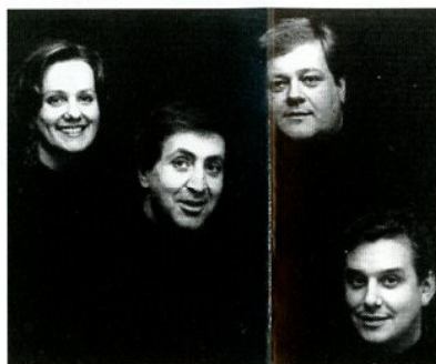
▼ Chilingirian Quartet

Season ticket for 5 evening concerts £25; Party rate for advance bookings of 10 or more £5; For Friday recital, party rate £3 Light refreshments available daily in a marquee sponsored by Glentree Estates.