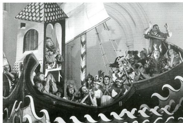
Noye's Fludde ▲

£14 (£11) res. £9 (£7) unres. Buffet including complimentary glass of wine £6.50 (book in advance)