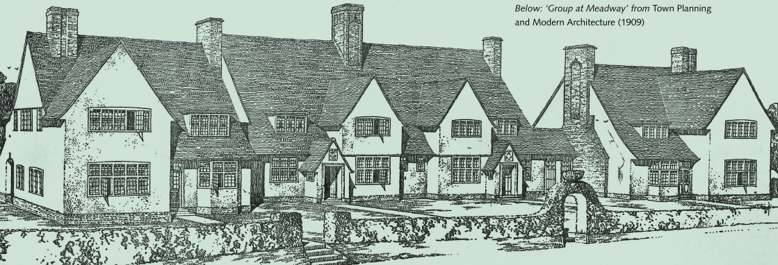
Below: 'Group at Meadway' from Town Planning and Modern Architecture (1909)