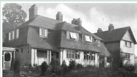
4 and 6 Temple Fortune Lane (1909-10)