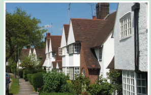
Erskine Hill (1908-9)