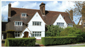
9 Meadway (1908-9)