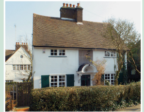
20 Erskine Hill (1910)