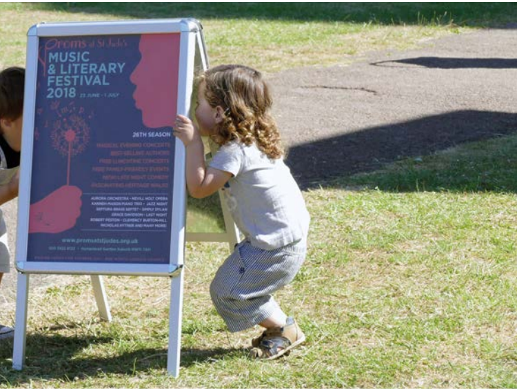
An insider look at this year's Proms