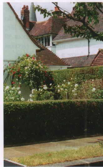
Below: Vivien Gear in one of the many quiet corners in her astonishing Welgarth Road garden that was one of three Suburb gardens open to the public as part of the National Gardens Scheme.