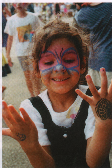
Not only faces this time but hands as well!