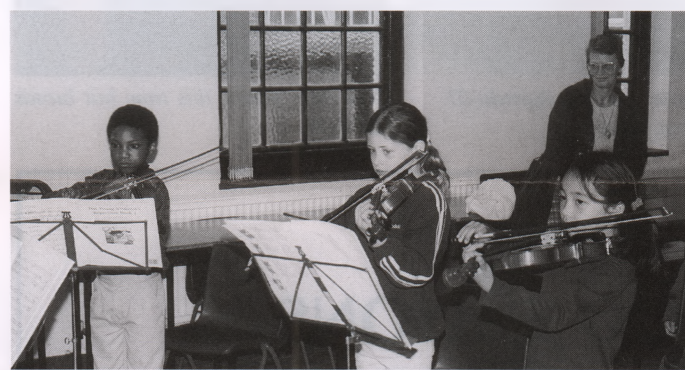
Young musicians taking part in Young Musicians Educational Trust's first Playathon on 13th June at the Youth Music Centre. Instrumentalists of all ages, including non YMC players, took part in the three and a half hour event which raised nearly £800 for YMET.