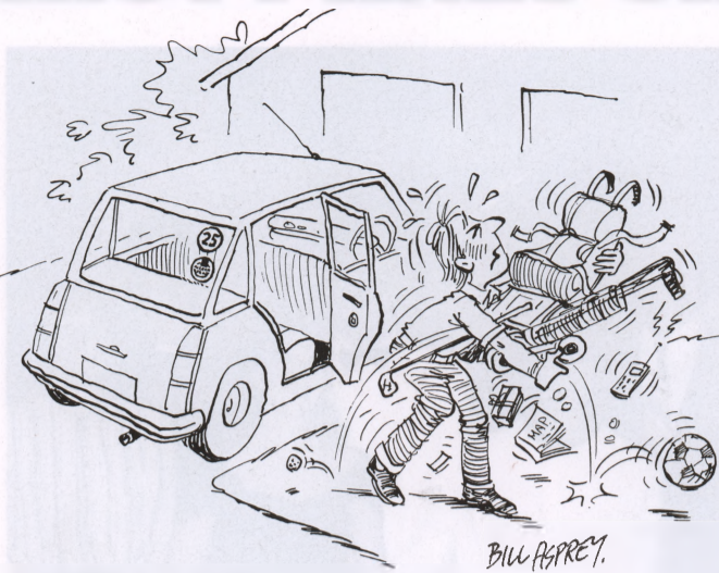
WHENEVER YOU LEAVE YOUR CAR ALWAYS REMOVE FROM VIEW EVERY MOVABLE OBJECT (INCLUDING YOUR REMOVABLE RADIO).

there was no burglar alarm or the alarm had not been set; 2 of the burgled houses were empty but being renovated by builders with valuable items left inside; 2 of the houses were entered by 'artifice' - ie the burglar posed as an official from the Council or from one of the utilities; and in one case, entry to the house was by using an unsecured ladder