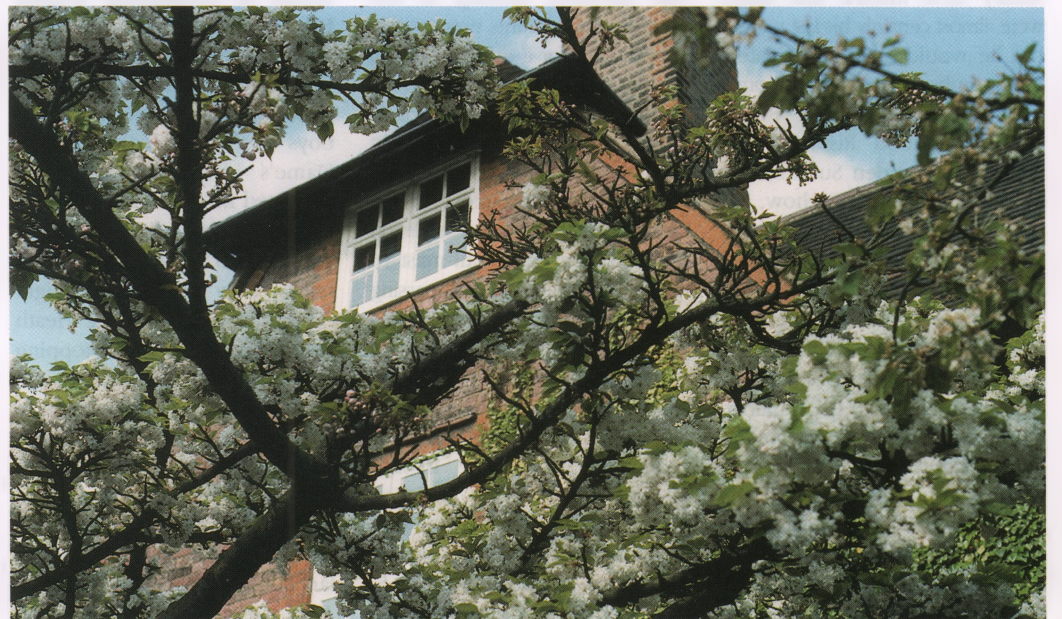
Double cherry, street tree in Wildwood Road.

SALES: 0181 458 7311 • LETTINGS: 0181 209 1144 698 FINCHLEY ROAD, LONDON NW11 7NE