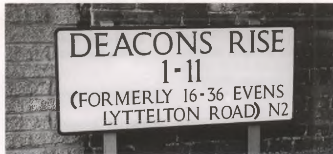
Some people will do anything to get Suburb News delivered. It was when they realised how many deliveries they were missing out on that residents successfully campaigned for a new name Deacon's Rise, for their part of Lyttelton Road.