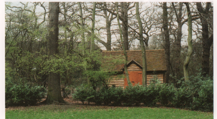
Highly commended, Stephen Brookhouse's design for the open air theatre in Littlewood for the Garden Suburb Theatre.