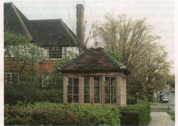
Highly commended, Ros Archer's design for a new entrance but at the HGS Synagogue.