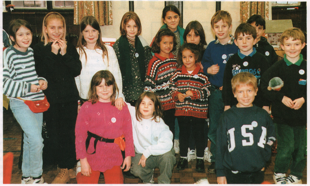
Some of the children involved in the Blue Peter Great Bring and Buy Sale for Leprosy. See story on page 3