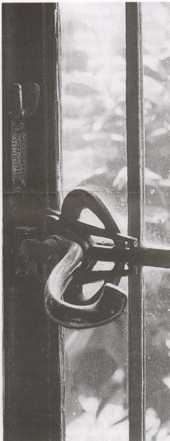
Image of decorative door handle with curved design.